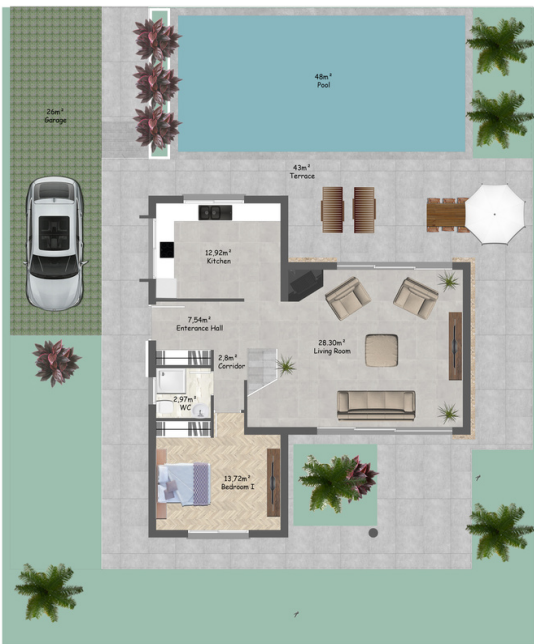
Ground Floor Plan Area: 139 m 2

VILLA II (A11), VILLA12(A12), VILLA 13(I3), VILLA 14(A14), VILLA15(A15), VILLA16(A16), VILLA 17(A17), VILLA18 (A18), VILLA 19(A19)