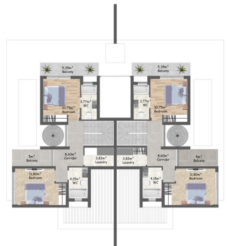
First Floor Plan Area: Each Unit 80m 2

A1(B1)-A2(B2), B1(B3)-B2(B4), C1(B5)-C2(B6), D1(B7)-D2(B8), E1(B9)-E2(B10), F1(B11)-F2(B12), G1(B13)-G2(B14), H1(B15)-H2(B16), I1(B17)-I2(B18), J1(B19)-J2(B20)