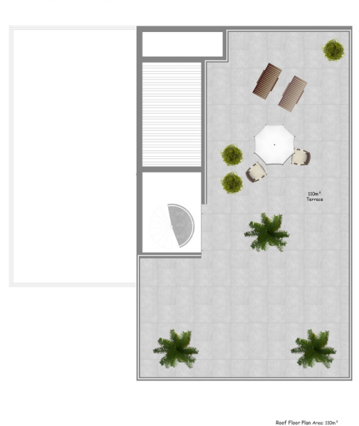
A1,A2,A3,A4 TYPE - WONDER STONES VILLAGE VILLA 6(A1), VILLA 6(A2), VILLA 6(A3), VILLA 6(A4)