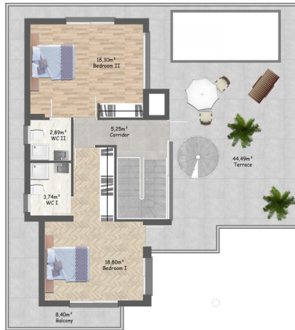
First Floor Plan Area: 60 m 2

VILLA II (A11), VILLA12(A12), VILLA 13(I3), VILLA 14(A14), VILLA15(A15), VILLA16(A16), VILLA 17(A17), VILLA18 (A18), VILLA 19(A19)