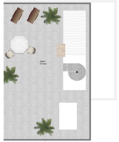
Roof Floor Plan Area: 104m 2

(A11), VILLA12(A12), VILLA 13(I3), VILLA 14(A14), VILLA15(A15), A16), VILLA 17(A17), VILLA18 (A18), VILLA 19(A19)