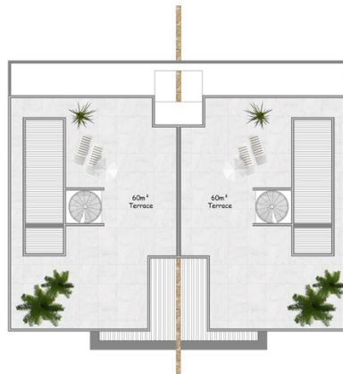
Roof Terrace Plan Area: Each Unit

A1(B1)-A2(B2), B1(B3)-B2(B4), C1(B5)-C2(B6), D1(B7)-D2(B8), E1(B9)-E2(B10), F1(B11)-F2(B12), G1(B13)-G2(B14), H1(B15)-H2(B16), I1(B17)-I2(B18), J1(B19)-J2(B20)