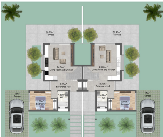
Ground Floor Plan Area: Each Unit 101m 2

A1(B1)-A2(B2), B1(B3)-B2(B4), C1(B5)-C2(B6), D1(B7)-D2(B8), E1(B9)-E2(B10), F1(B11)-F2(B12), G1(B13)-G2(B14), H1(B15)-H2(B16), I1(B17)-I2(B18), J1(B19)-J2(B20)